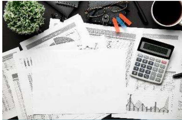
Ordinary income versus capital gains